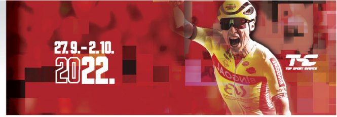
PHOTO FINISH - STAGE 3